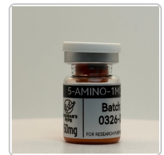
5-Amino-1MQ 50mg - 0326-D

The sample was confirmed to be 5-Amino-1MQ by HPLC. Identification by chromatographic retention time comparison with a reference standard.