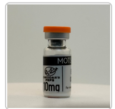
Mots-c 10mg - 0326-A

The sample was confirmed to be Mots-c by HPLC. Identification by chromatographic retention time comparison with a reference standard.