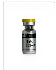
Mots-c 20mg - 2026-0710

The sample was confirmed to be Mots-c by HPLC. Identification by chromatographic retention time comparison with a reference standard.