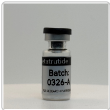
Retatrutide 10mg - 0326-A

The sample was confirmed to be Retatrutide by HPLC. Identification by chromatographic retention time comparison with a reference standard.