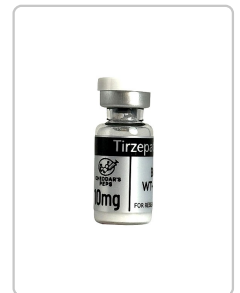
Tirzepatide 10mg - WT-0326-A

The sample was confirmed to be Tirzepatide by HPLC. Identification by chromatographic retention time comparison with a reference standard.