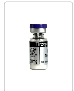
Tirzepatide 20mg - PU-0326-A

The sample was confirmed to be Tirzepatide by HPLC. Identification by chromatographic retention time comparison with a reference standard.