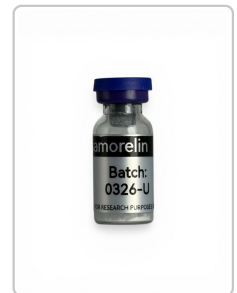
Tesamorelin 20mg - 0326-U

The sample was confirmed to be Tesamorelin by HPLC. Identification by chromatographic retention time comparison with a reference standard.